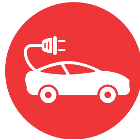
Battery Electric Vehicle OEMs and retailers