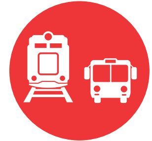
Transport operators and passenger hubs