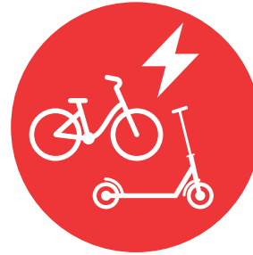
E-scooter/e-bike OEMs and retailers