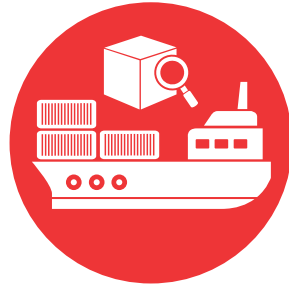
Courier services and Logistics providers