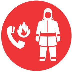
Emergency Fire and Rescue Services