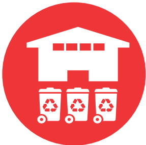
Recycling centres and consumer recycling points